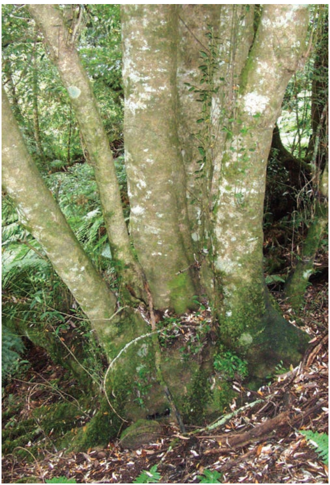
Fig. 4. Multi-stemmed specimen of Atherosperma moschatum.