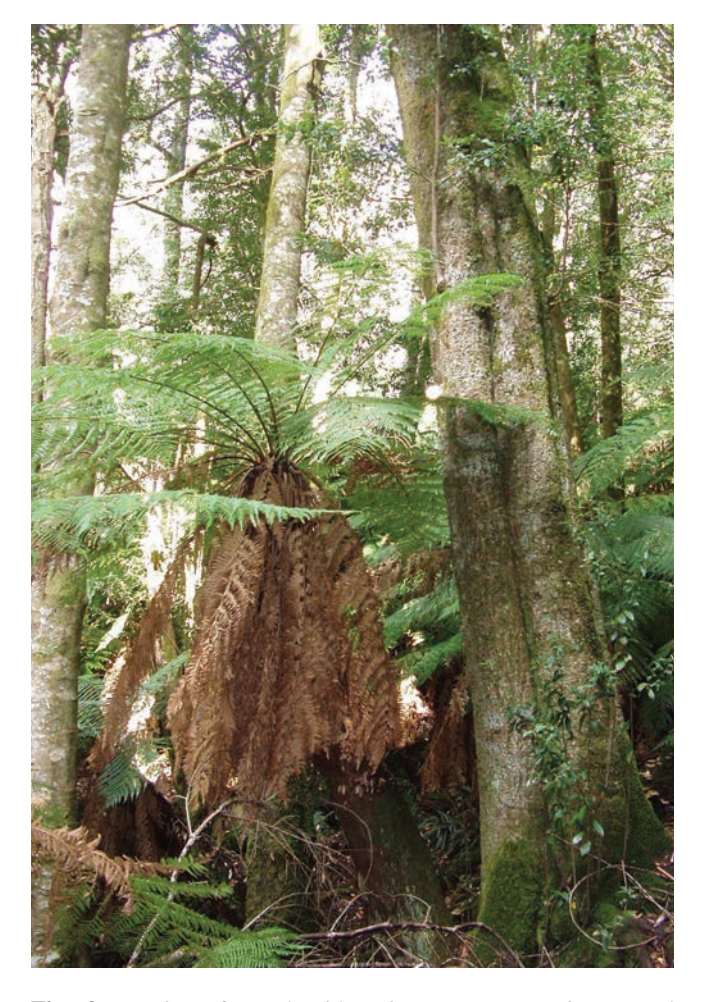
Fig. 3. Interior of stand with Atherosperma moschatum and Dicksonia antarctica .

The cool temperate rainforest stands in the Pilot Wilderness area are located in steep, narrow south or southeast facing drainage lines, ranging in elevation from 975–1405 m, with most stands occurring above 1200 m. The majority of stands in the area occur in the upper Pinch River catchment, bounded to the west by the Ingegoodbee and Cascade Fire Trails, to the north by the Tin Mine Fire Trail and to the east by the Charcoal Range Fire Trail, with one outlier stand in Tin Mine Creek and one stand in the upper Jacobs River catchment (Figure 1). All occurrences are on Mowamba Granodiorite, a unit which extends across a large area of southern Kosciuszko. The largest cool temperate rainforest stand is approximately 8 ha in area but as is typical for cool temperate rainforest, does not exhibit high plant species richness (18 species in