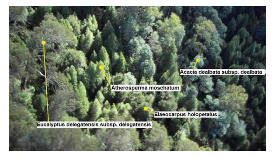
Fig. 2. Canopy types in the larger cool temperate rainforest stand. Oblique aerial image.

As the stands are small and restricted and embedded within more flammable eucalypt forest vegetation types, it is important to be able to accurately document their distribution, detail their composition and to assess any impact from the 2003 fires that may affect their viability. The aim of this short communication is to: a) examine the distribution and composition of newly discovered stands of cool temperate rainforest in Kosciuszko National Park and b) to briefly describe the impact of the 2003 fires on this restricted vegetation type.