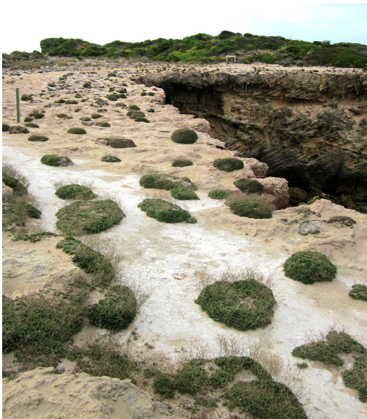
Fig. 2. Cushions of Limonium hyblaenum on coastal calcarenite clifftop, Robe, South Australia.

Of the rocky coastal sites, many in South Australia are on limestone (Fig. 1), as are all those in England (specimen labels at AD, OABIF 2013), while many in Victoria are