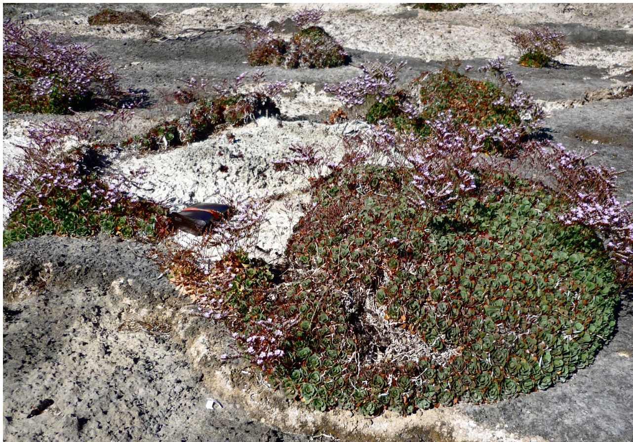
Fig. 4. Degenerating cushion of Limonium hyblaenum 40cm wide. Mounds of light grey to white fibrous peat can be seen in left part of cushion and sitting on grey calcarenite in background. Coffin Bay, South Australia.

I have not been able to find a reference to any control actions at all in other states.