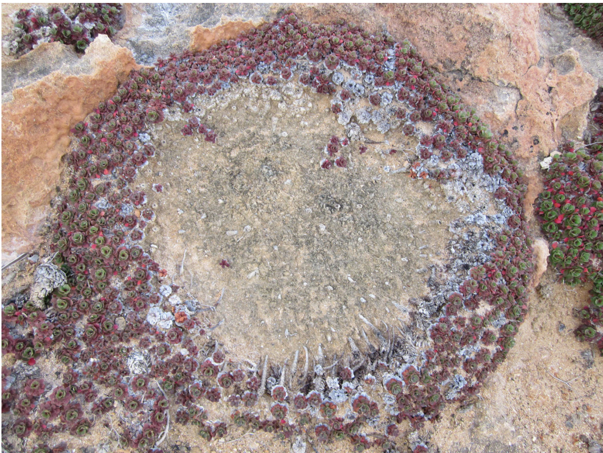
Fig. 5. Degenerating cushion of Limonium hyblaenum 25cm wide with progressively widening gap in centre. This is filled with light grey fibrous peat. On calcarenite, Robe, South Australia.

The association of the cushion habit with the salt spray zone of exposed coasts has been pointed out for some species, both in the Mediterranean (Nimis 1981) and in southern Australia (Parsons & Gibson 2009). The smooth, uniform surface of the cushion and its shape minimize the amount of salt spray intercepted; any shoot that extends beyond the common smooth surface will be exposed to a higher load of salt spray. The only reference I know dealing with this in Limonium is Schweingruber et al. (2006) for Limonium caprariense (Font Quer & Marcos) Pignatti, but the general phenomenon is dealt with by Boyce (1954). In the genus Limonium , clearly the cushion habit is more likely to be found in species which can occur in the salt spray zone than in species like Limonium vulgare which occur only in saltmarshes.