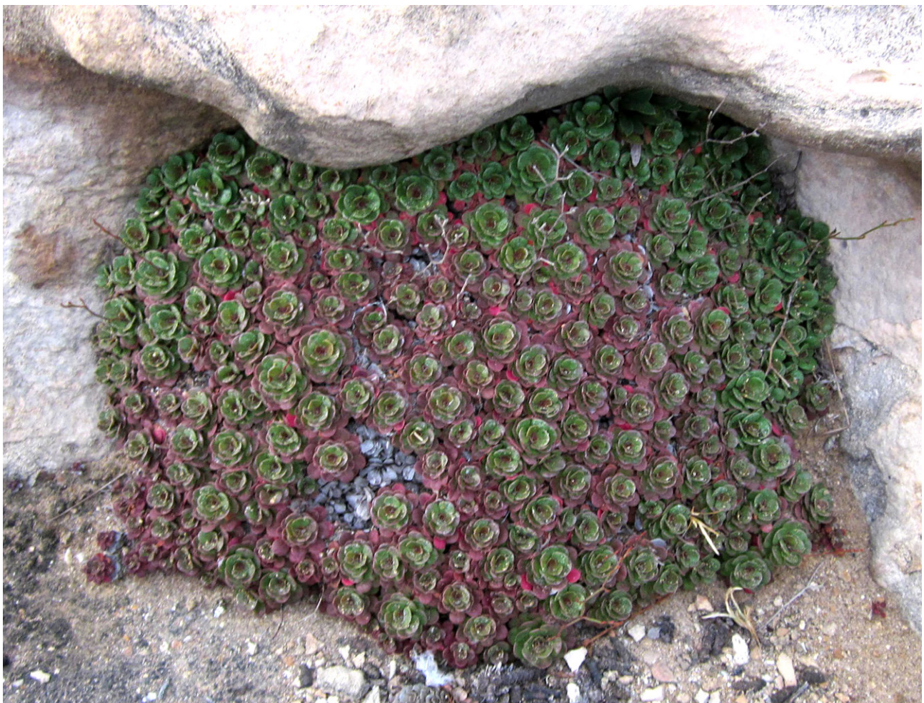
Fig. 1. Cushion of Limonium hyblaenum 20cm wide showing dense canopy and numerous small rosettes. On calcarenite, Robe, South Australia (photo R.J. Bates).

Limonium hyblaenum has small seeds 2 mm long (Walsh 1996). The fruit is a dry, membranous, one-seeded achene (Kubitzki 1993). In the genus and in Limonium hyblaenum itself, it is assumed that single seeds and the fruits are light enough to be readily dispersed both by wind and by animals (including birds, humans and rabbits), as well as by vehicles (Kubitzki 1993, Adair 2012, Rodrigo et al. 2012). On the south coast of England, it is assumed to be dispersed by gulls (OABIF 2013).