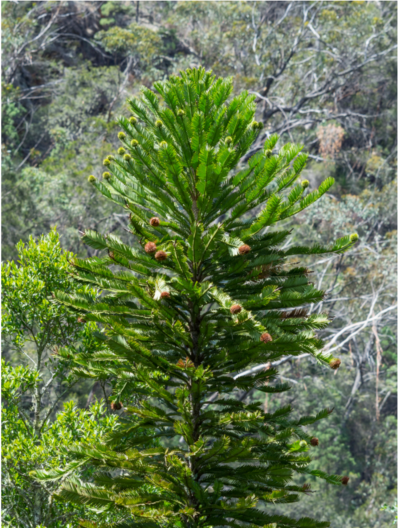
Fig. 1. Photograph of the top of Tree 19 in summer, showing mature female cones (mid-section; brown colour) and the immature next year's cohort (top section; green colour).