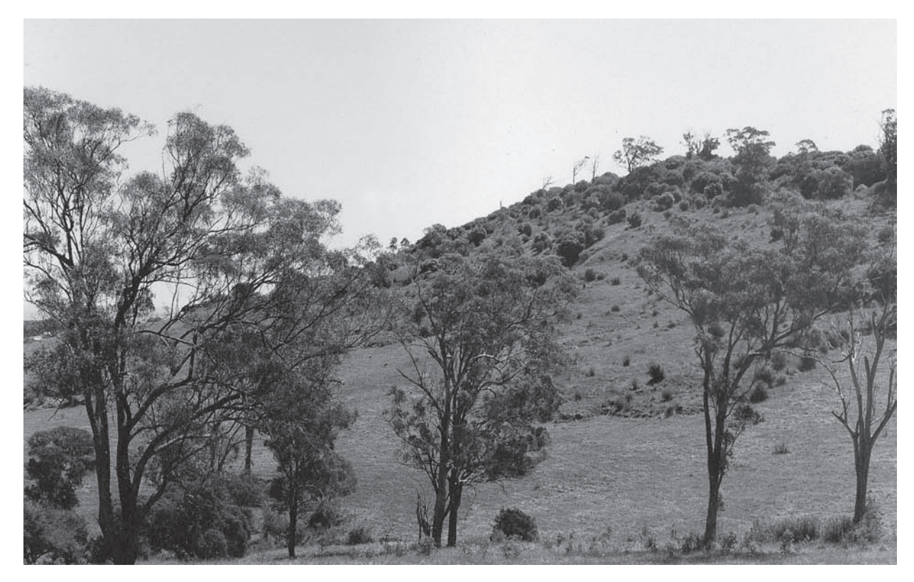
Fig. 4a. The eastern side of Mount Annan in 1984 as a grazing property, with African Olive plants already well-established on the steeper slopes.