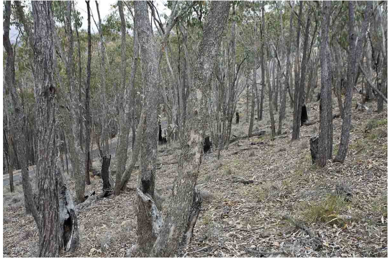
Photo 2: ID348b_SWS0507423.jpg Red Stringybark - Long-leaved Box - Broad-leaved Peppermint ( Eucalyptus dives ) open forest with Joycea pallida - snow grass tussock grass ground cover, Roseberg State Forest, Lyndhurst, South Eastern Highland Boregion, [AGD66 33°47.993'S 149°01.749'E], 1/06/2007, Jaime Plaza.

Photo 1: ID348a_SWS0507029.jpg Red Stringybark ( Eucalyptus macrorhyncha ) - Long-leaved Box ( Eucalyptus goniocalyx ) open forest with Joycea pallida tussock grass ground cover, southern aspect, Mundoonen Nature Reserve, Yass, [AGD66 34°50.335'S 149°02.504'E], 28/5/2007, Jaime Plaza.