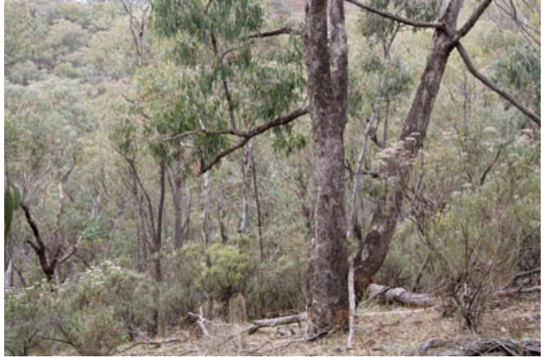
Photo 2: ID310b_DX28408.jpg Norton's Box ( Eucalyptus nortonii ) - Red Stringybark ( Eucalyptus macrorhyncha ) open forest on granite, Bogandyera Nature Reserve, [AGD66 35°54.081'S 147°50.753'E], 4/5/2006, Jaime Plaza.

Photo 1: ID310a_DX28624.jpg Norton's Box ( Eucalyptus nortonii ) - Red Stringybark ( Eucalyptus macrorhyncha ) grassy tall open forest with Cassinia longifolia and Melicytus dentatus on sheltered slopes in Tumbarumba-Murray River region, southern Bogandyera Nature Reserve, [AGD66 35°57.660'S 147°59.920'E], 5/5/2006, Jaime Plaza.