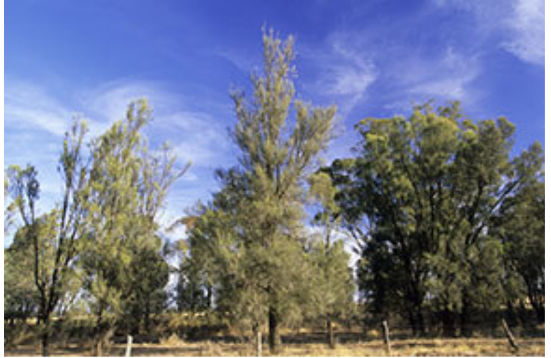
Photo 2: ID54b_PC251-9.jpg Allocasuarina luehmannii - E. microcarpa woodland, west side of Goobang National Park, [AGD66 32°46'22.5"S 148°16'49.5"E], 04/05/2005, Jaime Plaza.

Photo 1: ID54a_PC251-6.jpg Allocasuarina luehmannii - Eucalyptus microcarpa woodland, west side of Goobang National Park, [AGD66 32°46'22.5"S 148°16'49.5"E], 4/05/2005, Jaime Plaza.