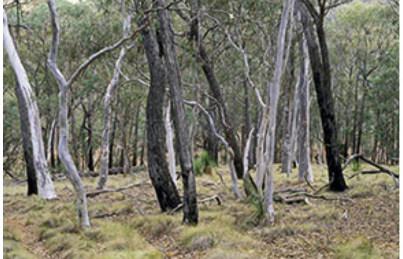
Photo 2: ID290b_PC191-8.jpg Eucalyptus rossii - E. macrorhyncha - Eucalyptus goniocalyx woodland on lower slopes in Nest Hill Nature Reserve, [AGD66 35°31'24"S 147°22'42"E], 15/10/02, Jaime Plaza.

Photo 1: ID290a_PC189-16.jpg Eucalyptus rossii - Eucalyptus macrorhyncha - Eucalyptus polyanthemos tussock grass - shrub woodland, Livingstone National Park, [AGD66 35°21'35"S 147°21'28"E], 15/10/02, Jaime Plaza.