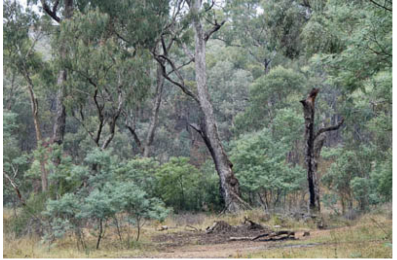
Photo 2: ID298b_DX28340.jpg Norton's Box ( Eucalyptus nortonii ) - Apple Box ( Eucalyptus bridgesiana ) - Acacia dealbata valley flat open forest, Jingellic Nature Reserve, [AGD66 35°54.515'S 147°48.694'E], 3/5/2006, Jaime Plaza.

Photo 1: ID298a_S7300406.jpg Norton's Box ( Eucalyptus nortonii ) - Apple Box ( Eucalyptus bridgesiana ) with Silver Wattle ( Acacia dealbata ) and sedge-grass ground cover on a valley flat in Werboldera SCA near Tumut, [AGD66 35°20.134'S 148°13.427'E], 30/5/2006, Jaime Plaza.