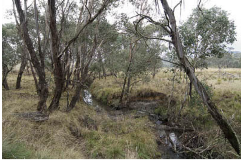
Photo 2: ID285b_DX28285.jpg Broad-leaved Sally ( Eucalyptus camphora subsp. humeana ) with a sedgeland wetland at Tin Mines Camping Area Woomargama National Park east of Albury NSW south western slopes, [AGD66 35°51.665'S 147°28'503'E], 3/5/2006, Jaime Plaza.

Photo 1: ID285a_DX28027.jpg Broad-leaved Sally ( Eucalyptus camphora subsp. humeana ) bordering Tarcutta Swamp near Batlow, NSW South East Highlands Bioregion [AGD66 35°40.470'S 148°02.096'E], 1/5/2006, Jaime Plaza.