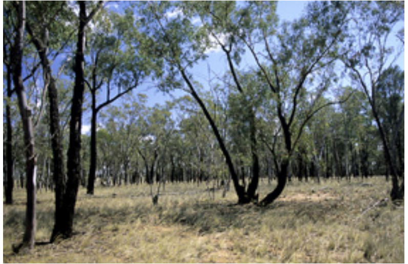
Photo 2: ID243b_img179pc.jpg Eucalyptus sideroxylon - Austrostipa scabra Woodland, Tottenham-Albert Rd, [AGD66 32°21'53.6"S 147°24'56.2"E], 27/10/01, Jaime Plaza.

Photo 1: ID243a_img178pc.jpg Eucalyptus sideroxylon - Austrostipa scabra Woodland, Tottenham-Albert Rd, [AGD66 32°21'53.6"S 147°24'56.2"E], 27/10/01, Jaime Plaza.