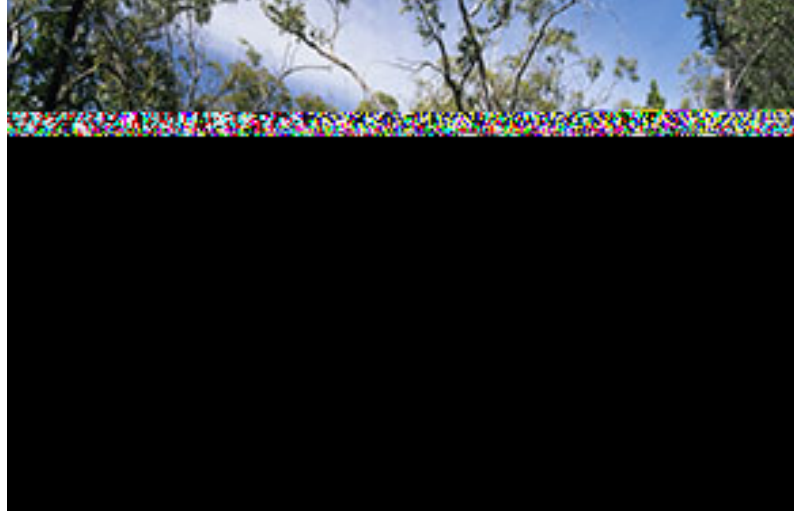
Photo 1: ID354a_PC245-20.jpg Eucalyptus macrorhyncha - E. goniocalyx low woodland with Triodia scariosa ground cover on ridge on the Bunberry Ridge in Goobang National Park, [AGD66 33°10'23.8"S 148°24'0.5"E], 03/05/2005, Jaime Plaza.

Characteristic Vegetation: (Quantitative Data)