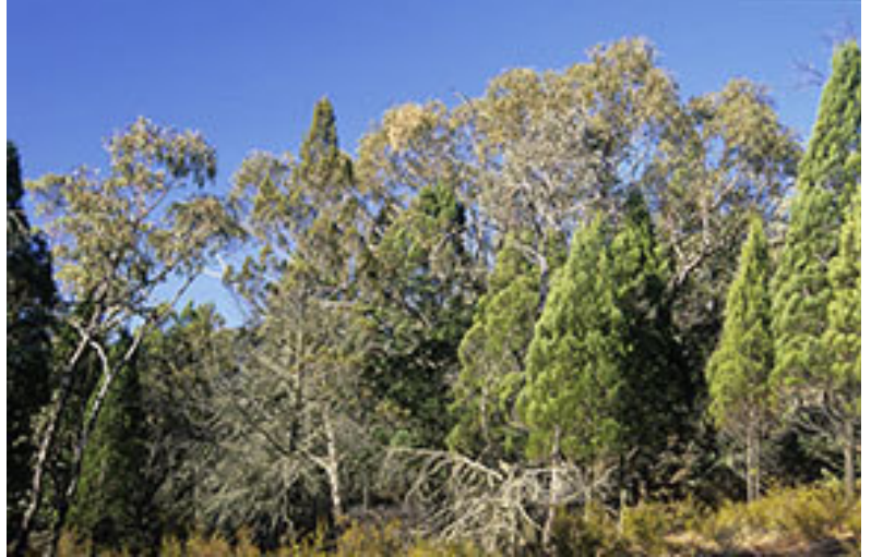
Photo 2: ID321b_SWS0507271.jpg Red Stringybark ( Eucalyptus macrorhyncha ) - Long-leaved Box ( Eucalyptus goniocalyx ) - Black Cypress Pine ( Callitris endlicheri ) open forest with a shrub/grass ground cover on a quartz sandstone ridge of the Douglas Range near Young, [AGD66 34°27.790'S 148°33.112'E], 30/5/07, Jaime Plaza.

Photo 1: ID321a_PC243-21.jpg Callitris endlicheri - Eucalyptus goniocalyx - E. macrorhyncha dry woodland, Barton NR, [AGD66 33°18'21.9"S 148°53'42.3"E], 03/05/2005, Jaime Plaza.