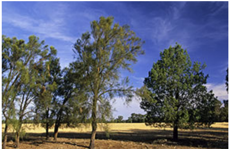
Photo 3: ID54c_Img393mp.jpg Allocasuarina luehmannii and Callitris glaucophylla open woodland with Acacia hakeoides , in the north-west section of Goobang National Park, NSW south west slopes, 1997, M.F. Porteners.

Photo 2: ID54b_PC251-9.jpg Allocasuarina luehmannii - E. microcarpa woodland, west side of Goobang National Park, [AGD66 32°46'22.5"S 148°16'49.5"E], 04/05/2005, Jaime Plaza.