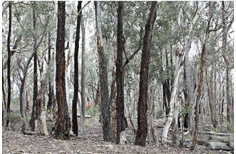
Photo 3: ID342c_benson.jpg Eucalyptus sideroxylon woodland with E. blakelyi and Callitris endlicheri on roadside near "Fernhill", south-east of Koorawatha, [AGD66 34°08.437'S 148°34.424'E], 13/2/2007, J.S. Benson.

Photo 2: ID342b_SWS0507440.jpg Eucalyptus sideroxylon with Eucalyptus macrorhyncha and Eucalyptus polyanthemos in Wyangala State Recreation Area south of Lyndhurst, [AGD66 33°53.406'S 148°59.701'E], 1/6/2007, Jaime Plaza.