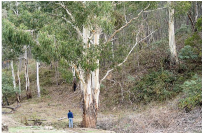
Photo 3: ID299c_DX28431.jpg Riparian Ribbon Gum ( Eucalyptus viminalis ) - Robertson's Peppermint ( Eucalyptus robertsonii ) - Apple Box ( Eucalyptus bridgesiana ) tall open forest on red earth soil along a creek in Bogandyera Nature Reserve, [AGD66 35°53.767'S 147°52.813'E], 4/5/2006, Jaime Plaza.

Photo 2: ID299b_DX27921.jpg Ribbon Gum ( Eucalyptus viminalis ) - Robertson's Peppermint ( Eucalyptus robertsonii ) tall open forest along creek east of Tumut, [AGD66 35°23.443'S 148°13.920'E], 30/4/2006, Jaime Plaza.