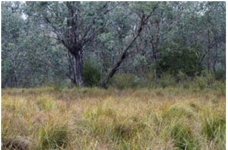
Photo 3: ID285c_DX28231.jpg Broad-leaved Sally ( Eucalyptus camphora subsp. humeana ) with the tall sedge Carex fascicularis lining a narrow creek in Woomargama National Park east of Albury NSW, [AGD66 35°52.683'S 147°19'820'E], 2/5/2006, Jaime Plaza.

Photo 2: ID285b_DX28285.jpg Broad-leaved Sally ( Eucalyptus camphora subsp. humeana ) with a sedgeland wetland at Tin Mines Camping Area Woomargama National Park east of Albury NSW south western slopes, [AGD66 35°51.665'S 147°28'503'E], 3/5/2006, Jaime Plaza.