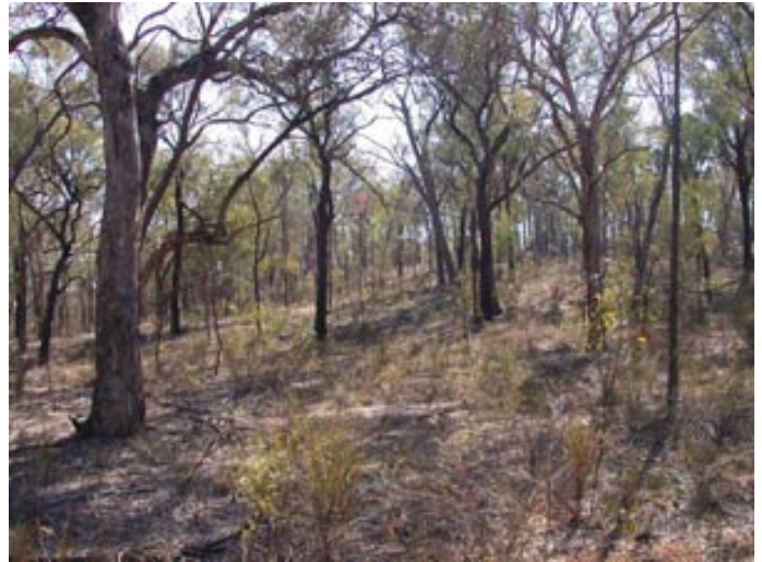
Photo 3: ID343c_capararo.jpg Mugga Ironbark ( Eucalyptus sideroxylon ) with Red Stringybark ( Eucalyptus macrorhyncha ) and Red Box ( Eucalyptus polyanthemos ) roadside remnant on Keujura Road near Tarcutta, April 2007, S. Capararo.

Photo 2: ID343b_capararo.jpg Mugga Ironbark ( Eucalyptus sideroxylon ) - Red Stringybark ( Eucalyptus macrorhyncha ) tall woodland on hillslope in Mates Gully TSR near Tarcutta, April 2007, S. Capararo.