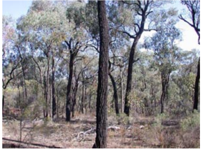
Photo 2: ID343b_capararo.jpg Mugga Ironbark ( Eucalyptus sideroxylon ) - Red Stringybark ( Eucalyptus macrorhyncha ) tall woodland on hillslope in Mates Gully TSR near Tarcutta, April 2007, S. Capararo.

Photo 1: ID343a_capararo.jpg Mugga Ironbark ( Eucalyptus sideroxylon ) tall woodland in Mates Gully TSR near Tarcutta, April 2007, S. Capararo.