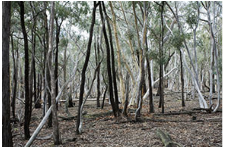
Photo 3: ID289c_SWS0507183.jpg Mugga Ironbark - Scribbly Gum - Long-leaved Box open forest on red clay from phyllite on Rugby - Crookwell Road [AGD66 34°23.981'S 149°00.963'E], 29/5/2007, Jaime Plaza.

Photo 2: ID289b_SWS0507243.jpg Mugga Ironbark - Inland Scribbly Gum open forest with Lissanthe strigosa on hillcrest north west of Boorowa, [AGD66 34°19.906'S 148°38.853'E], 30/5/07, Jaime Plaza.