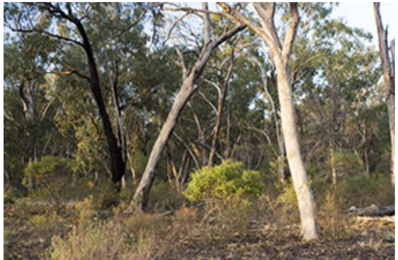
Photo 3: ID217c_img300pc.jpg Eucalyptus sideroxylon - E. microcarpa woodland, Big Bush Nature Reserve, [AGD66 34°21'19"S 147°25'24"E], 13/10/02, Jaime Plaza.

Photo 2: ID217b_SWS0507536.jpg Mugga Ironbark ( Eucalyptus sideroxylon ) - Western Grey Box ( Eucalyptus microcarpa ) shrubby tall woodland near Reefton on the Temora to Wyalong Road, [AGD66 34°16.579'S 147°26.929'E], 30/5/2007, Jaime Plaza.