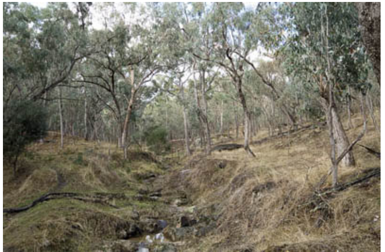
Photo 3: ID298c_PC199-1.jpg Eucalyptus nortonii - Eucalyptus polyanthemos - E. macrorhyncha gully woodland in Downfall Nature Reserve, [AGD66 35°34'14"S 147°50'52"E], 17/10/02, Jaime Plaza.

Photo 2: ID298b_DX28340.jpg Norton's Box ( Eucalyptus nortonii ) - Apple Box ( Eucalyptus bridgesiana ) - Acacia dealbata valley flat open forest, Jingellic Nature Reserve, [AGD66 35°54.515'S 147°48.694'E], 3/5/2006, Jaime Plaza.