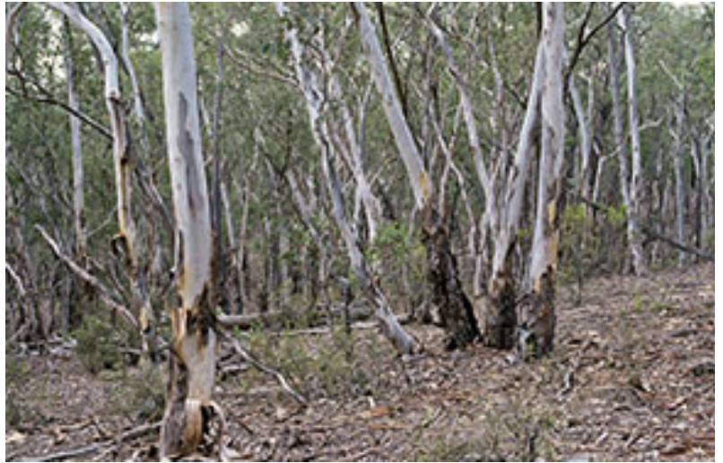
Photo 3: ID287c_PC192-13.jpg Eucalyptus macrorhyncha - E.goniocalyx - E.polyanthemos woodland, Minjary National Park, [AGD66 35°13'20"S 148°07'14"E], 16/10/02, Jaime Plaza.

Photo 2: ID287b_PC175-3.jpg Eucalyptus polyanthemos - Eucalyptus macrorhyncha shrub grass woodland, Conimbla National Park, [AGD66 33°48'38"S 148°20'55"E], 11/10/02, Jaime Plaza.