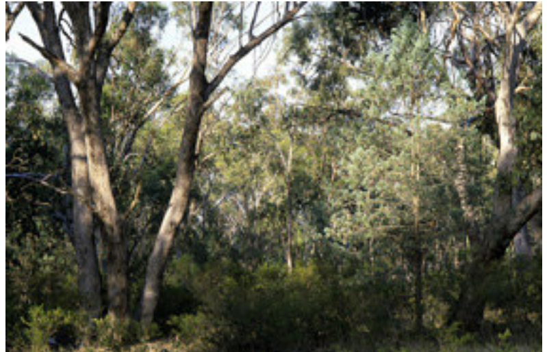
Photo 3: ID110c_PC167.jpg Eucalyptus microcarpa - Callitris glaucophylla woodland, Nangar National Park, [AGD66 33°24'28"S 148°27'49"E], 9/10/02, Jaime Plaza.

Photo 2: ID110b_img002pc.jpg Eucalyptus microcarpa - Callitris glaucophylla shrubby woodland, The Rock Nature Reserve, [AGD66, 35°15'43.4"S 147°04'31.1"E], 8/4/02, Jaime Plaza.