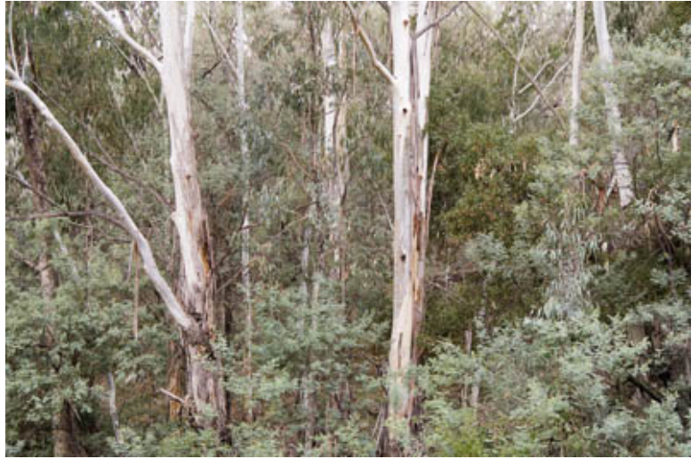
Photo 2: ID299b_DX27921.jpg Ribbon Gum ( Eucalyptus viminalis ) - Robertson's Peppermint ( Eucalyptus robertsonii ) tall open forest along creek east of Tumut, [AGD66 35°23.443'S 148°13.920'E], 30/4/2006, Jaime Plaza.

Photo 1: ID299a_DX27941.jpg Ribbon Gum ( Eucalyptus viminalis ) - Norton's Box ( Eucalyptus nortonii ) tall open forest along Tumut River below Blowering Dam, [AGD66 35°24.062'S 148°13.936'E], 30/4/2006, Jaime Plaza.