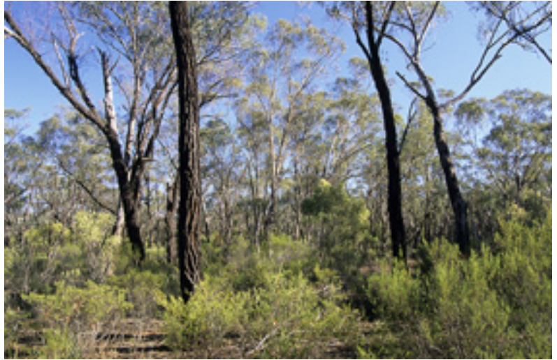
Photo 2: ID217b_SWS0507536.jpg Mugga Ironbark ( Eucalyptus sideroxylon ) - Western Grey Box ( Eucalyptus microcarpa ) shrubby tall woodland near Reefton on the Temora to Wyalong Road, [AGD66 34°16.579'S 147°26.929'E], 30/5/2007, Jaime Plaza.

Photo 1: ID217a_img146pc.jpg Eucalyptus sideroxylon - E. microcarpa woodland, The Charcoal Tank Nature Reserve, [AGD66 33°59'05.6"S 147°09'17.7"E], 19/4/02, Jaime Plaza.