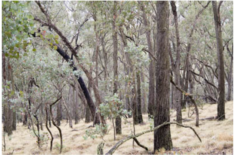
Photo 2: ID294b_DX28098.jpg Red Box ( Eucalyptus polyanthemos ) - White Box ( Eucalyptus albens ) - Red Stringybark ( Eucalyptus macrorhyncha ) open forest at Tunnel Creek in Woomargama National Park, [AGD66 35°52.847'S 147°17.874'E], 1/5/2006, Jaime Plaza.

Photo 1: ID294a_DX28161.jpg Norton's Box ( Eucalyptus nortonii ) - Red Box ( Eucalyptus polyanthemos ) open forest with Joycea pallida ground cover on shallow grey sandy loam on granite, Wangra Trail, Woomargama National Park, [AGD66 35°56.148'S 147°17.458'E], 2/5/2006, Jaime Plaza.