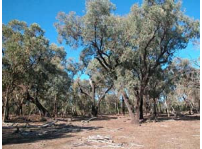
Photo 2: ID342b_SWS0507440.jpg Eucalyptus sideroxylon with Eucalyptus macrorhyncha and Eucalyptus polyanthemos in Wyangala State Recreation Area south of Lyndhurst, [AGD66 33°53.406'S 148°59.701'E], 1/6/2007.

Photo 1: ID342a_benson.jpg Eucalyptus sideroxylon - E. polyanthemos woodland in Ilunie Nature Reserve south east of Koorawatha, [AGD66 34°09.806'S 148°35.671'E], 13/2/2007.