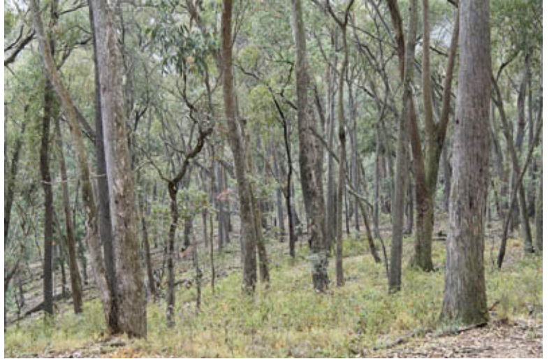
Photo 2: ID297b_DX28318.jpg Broad-leaved Peppermint ( Eucalyptus dives ) - Norton's Box ( Eucalyptus nortonii ) - Red Stringybark ( Eucalyptus macrorhyncha ) open forest with Joycea pallida on red clay loam, Tin Mines Fire Trail, Woomargama National Park, [AGD66 35°51.055'S 147°34.347'E], 3/5/2006, Jaime Plaza.

Photo 1: ID297a_DX28155.jpg Broad-leaved Peppermint ( Eucalyptus dives ) - Norton's Box ( Eucalyptus nortonii ) - Red Stringybark ( Eucalyptus macrorhyncha ) open forest on slopes with red clay, Wangra Trail, Woomargama National Park, [AGD66 35°55.607'S 147°17.719'E], 2/5/2006, Jaime Plaza.