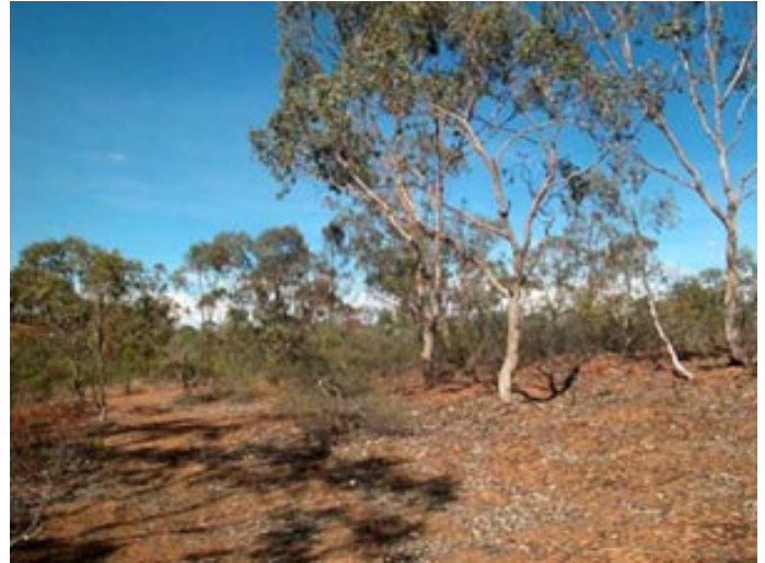
Photo 2: ID346b_benson.jpg Blakely's Red Gum ( Eucalyptus blakelyi) with White Cypress Pine ( Callitris glaucophylla) on hills on the Old Narranderra Road west of Wagga Wagga, [AGD66 35°04.126'E 147 16.307'S, 14/2/2007

Photo 1: ID346a_benson.jpg White Box ( Eucalyptus albens) woodland with a shrubby understorey of Dillwynia sericea and Acacia spp. on shallow soil on a metamorphic substrate on hills west of Wagga Wagga, [AGD66 35°07.563'S 147°17.989'E], 14/2/2007