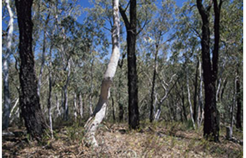
Photo 2: ID289b_SWS0507243.jpg Mugga Ironbark - Inland Scribbly Gum open forest with Lissanthe strigosa on hillcrest north west of Boorowa, [AGD66 34°19.906'S 148°38.853'E], 30/5/07, Jaime Plaza.

Photo 1: ID289a_PC208-17.jpg Mugga Ironbark ( Eucalyptus sideroxylon ) - Inland Scribbly Gum ( E. rossii ) - E.goniocalyx hill woodland in Ellerslie Nature Reserve, [AGD66 35°14'42"S 147°52'01"E], 20/10/02, Jaime Plaza.