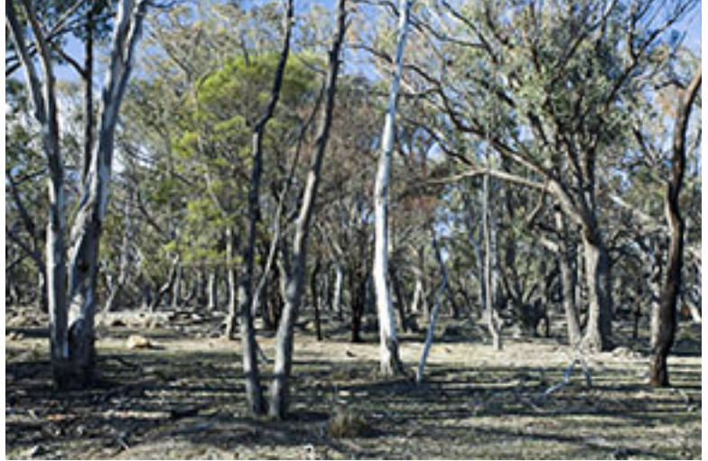
Photo 2: ID352b_SWS0507199.jpg Blakely's Red Gum ( Eucalyptus blakelyi ) and Red Stringybark ( Eucalyptus macrorhyncha ) open forest on a rocky outcrop above the upper Lachlan River between Rye Park and Crookwell, [AGD66 34°25.204'S 149°05.668'E], 29/5/2007, Jaime Plaza.

Photo 1: ID352a_SWS0507063.jpg Red Stringybark ( Eucalyptus macrorhyncha ) and Blakely's Red Gum ( Eucalyptus blakelyi ) open forest on red clay soil on a hillslope on Blackery's Road north-east of Yass, [AGD66 34°49.07'S 148°52.450'E], 29/5/2007, Jaime Plaza.