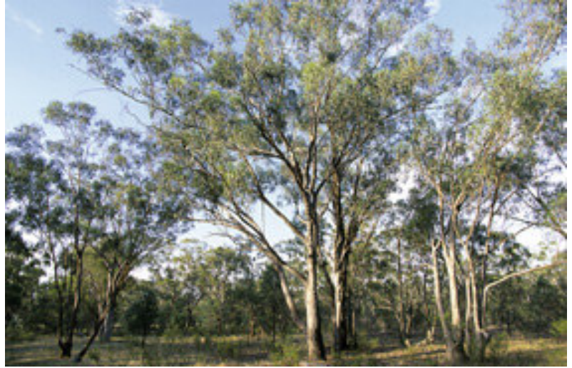
Photo 2: ID110b_img002pc.jpg Eucalyptus microcarpa - Callitris glaucophylla shrubby woodland, The Rock Nature Reserve, [AGD66, 35°15'43.4"S 147°04'31.1"E], 8/4/02, Jaime Plaza.

Photo 1: ID110a_img001pc.jpg Eucalyptus microcarpa - Callitris glaucophylla shrubby woodland, The Rock Nature Reserve, [AGD66, 35°15'43.4"S 147°04'31.1"E], 8/4/02, Jaime Plaza.