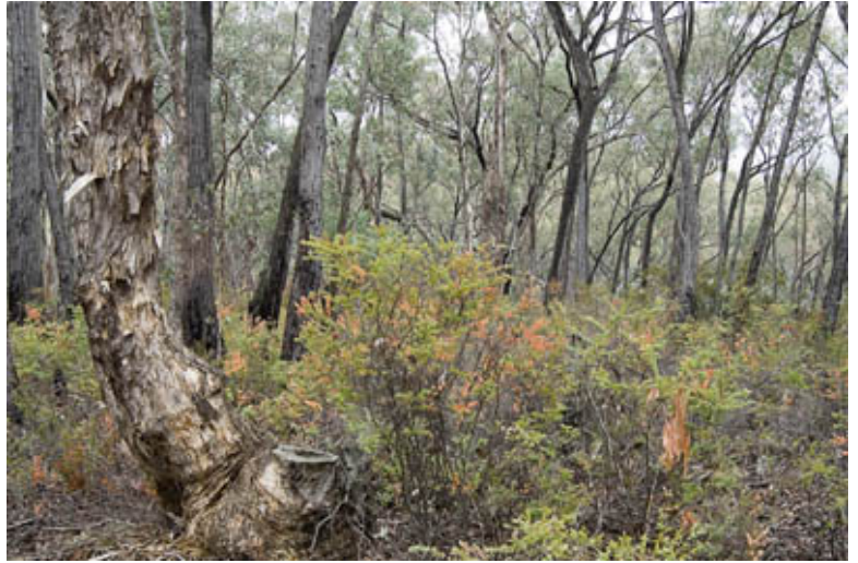
Photo 2: ID306b_S9300406.jpg Red Box ( Eucalyptus polyanthemos ) with Red Stringybark ( Eucalyptus macrorhyncha ) with a tussock grass ( Joycea pallida ) Nodding Blue Lily ( Stypandra glauca ) and shrub understorey on a quartzite hillcrest in Werboldera SCA near Tumut, [AGD66 35°21.064'S 148°13.405'E], 30/4/2006, Jaime Plaza.

Photo 1: ID306a_S8300406.jpg Red Box ( Eucalyptus polyanthemos ) with Red Stringybark ( Eucalyptus macrorhyncha ) with shrubby understorey including Acacia pravissima on quartzite hillcrest in Werboldera SCA near Tumut, [AGD66 35°20.277'S 148°13.428'E], 30/4/2006, Jaime Plaza.