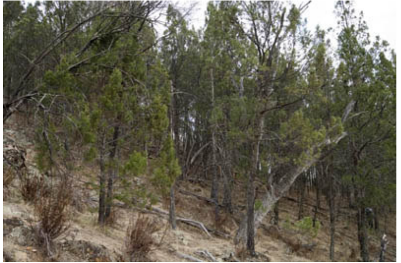
Photo 2: ID309b_DX28175.jpg Black Cypress Pine ( Callitris endlicheri ) - Long-leaved Box ( Eucalyptus goniocalyx ) - Red Stringybark ( Eucalyptus macrorhyncha ) low open forest on a granite ridge in Woomargama National Park, [AGD66 35°52.583'S 147°18.894'E], 2/5/2006, Jaime Plaza.

Photo 1: ID309a_DX28816.jpg Black Cypress Pine ( Callitris endlicheri ) low open forest with Dwyer's Red Gum ( Eucalyptus dwyeri ) and Red Stringybark ( Eucalyptus macrorhyncha ) with a ground cover of Cheilanthes sieberi and Stypandra glauca on quartz-rich adamellite in Mudjarn Nature Reserve (Pine Mountain) north of Tumut, [AGD66 35°10.920'S 148°13.942'E], 7/5/2006, Jaime Plaza.