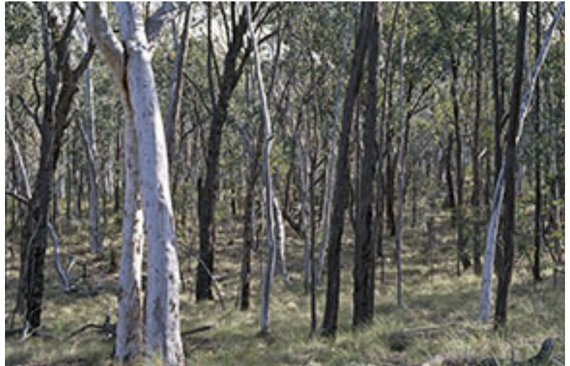
Photo 3: ID290c_DX28358.jpg Red Box ( Eucalyptus polyanthemos ) - Long-leaved Box ( Eucalyptus goniocalyx ) - Red Stringybark ( Eucalyptus macrorhyncha ) low open forest on red soils on a hillcrest in Jingellic Nature Reserve, [AGD66 35°54.227'S 147°45.906'E], 3/5/2006, Jaime Plaza.

Photo 2: ID290b_PC191-8.jpg Eucalyptus rossii - E. macrorhyncha - Eucalyptus goniocalyx woodland on lower slopes in Nest Hill Nature Reserve, [AGD66 35°31'24"S 147°22'42"E], 15/10/02, Jaime Plaza.