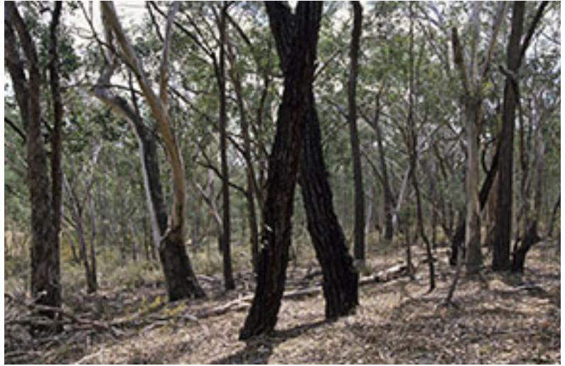
Photo 2: ID291b_PC187-19.jpg Eucalyptus macrorhyncha - Eucalyptus rossii - E. sideroxylon woodland, Livingstone National Park, [AGD66 35°20'50"S 147°20'44"E], 15/10/02, Jaime Plaza.

Photo 1: ID291a_PC188-3.jpg Eucalyptus macrorhyncha - Eucalyptus rossii - E. sideroxylon woodland, Livingstone National Park, [AGD66 35°20'50"S 147°20'44"E], 15/10/02, Jaime Plaza.