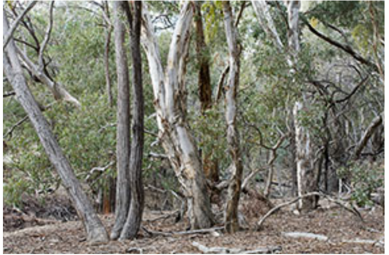
Photo 2: ID287b_PC175-3.jpg Eucalyptus polyanthemos - Eucalyptus macrorhyncha shrub grass woodland, Conimbla National Park, [AGD66 33°48'38"S 148°20'55"E], 11/10/02, Jaime Plaza.

Photo 1: ID287a_SWS0507106.jpg Red Box ( Eucalyptus polyanthemos ) - Long-leaved Box ( Eucalyptus goniocalyx ) and Red Stringybark ( Eucalyptus macrorhyncha ) open forest on brown clay derived from phyllite, 10 km south-east of Rye Park, [AGD66 34°33.418'S 148°59.025'E], 29/5/2007, Jaime Plaza.