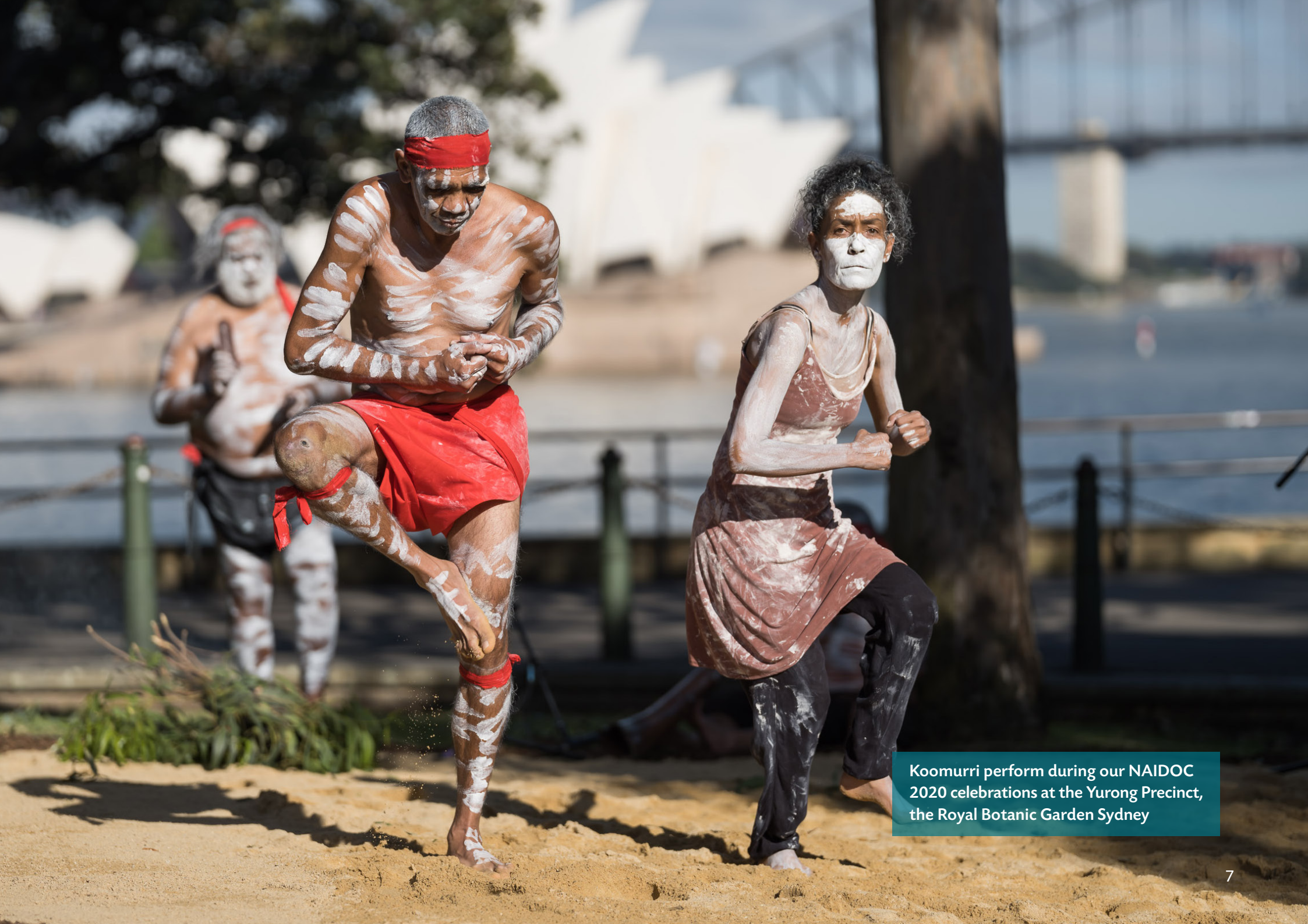
Koorri perform during our NAIDOC 2020 celebrations at the Yurong Precinct, the Royal Botanic Garden Sydney