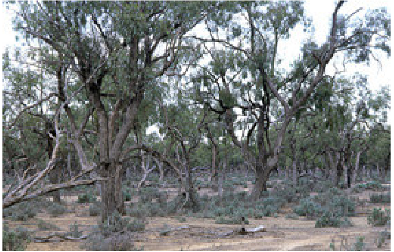
Photo 2: ID15b_img073pc.jpg Eucalyptus largiflorens - Maireana pyramidata woodland, Darling Anabranche, Nearie Lake turnoff, [AGD66 33°34'0.2"S 141°45'36.8"E], 13/4/02, Jaime Plaza.

Photo 1: ID15a_img059pc.jpg Eucalyptus largiflorens - Maireana pyramidata woodland, west of Oxley, [AGD66 34°12'16.6"S 143°51'28.9"E], 12/4/02, Jaime Plaza.