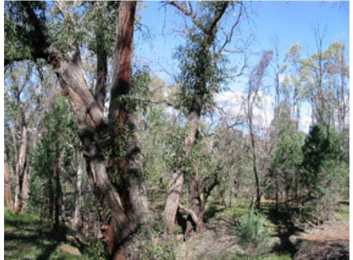
Photo 2: ID239b_Ballestrin.jpg Red Stringybark ( Eucalyptus macrorhyncha ) with Eucalyptus dwyeri in Duncans Creek, Cocoparra National Park; 01/08/2004, M. Ballestrin.

Photo 1: ID239a_Ballestrin.jpg Red Stringybark ( Eucalyptus macrorhyncha ) with Callitris endlicheri and Eucalyptus dwyeri in gully near The Pines, Cocoparra National Park; 21/10/2004, M. Ballestrin.