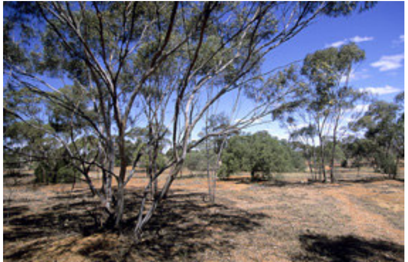
Photo 3: ID176c_dsc_2662.jpg Green Mallee ( Eucalyptus viridis ) mallee woodland, approx. 10km E of Coolabah, NSW-NWP, Cobar Penneplain, [AGD66 31°1'29"S 146°52'55"E], 27/8/03, Jaime Plaza.

Photo 2: ID176b_img232pc.jpg Eucalyptus viridis Woodland (degraded), Sth of Canbelego, [AGD66 31°38'05.0"S 146°20'07.0"E], 26/10/01, Jaime Plaza.