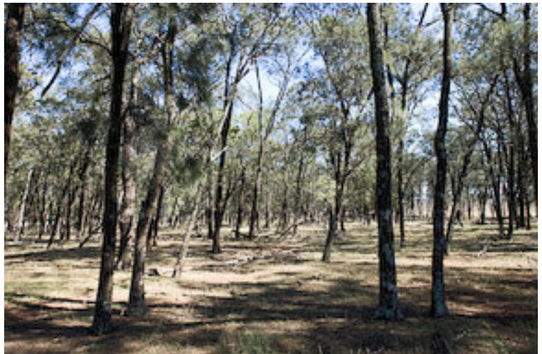
Photo 3: ID55c_BBS MAY 2008 1092.jpg Belah - Wilga woodland on a brown clay loam flat, Squires Lane, Pilliga National Park [AGD66 30°30'51"S 148°59'49.3"E], 06/05/08

Photo 2: ID55b_BBSMAY09_0071.jpg Belah ( Casuarina cristata) open forest remnant on basalt soils on the Liverpool Plains, [AGD66 31°0'47.8"S, 149°57'58.7"E], 6/5/09