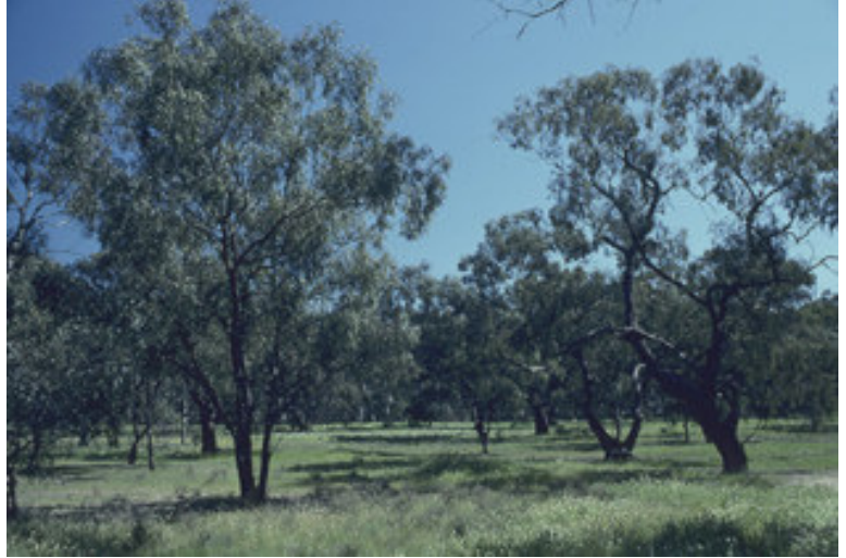
Photo 2: ID16b_img385mp.jpg Black Box ( Eucalyptus largiflorens ) open woodland with understorey of scattered Old Man Saltbush ( Atriplex nummularia ), 2003, M.F. Porteners.

Photo 1: ID16a_img386mp.jpg Black Box ( Eucalyptus largiflorens ) open woodland with annual grass ground cover ( Hordeum leporinum and Lolium perenne ), 2003, M.F. Porteners.