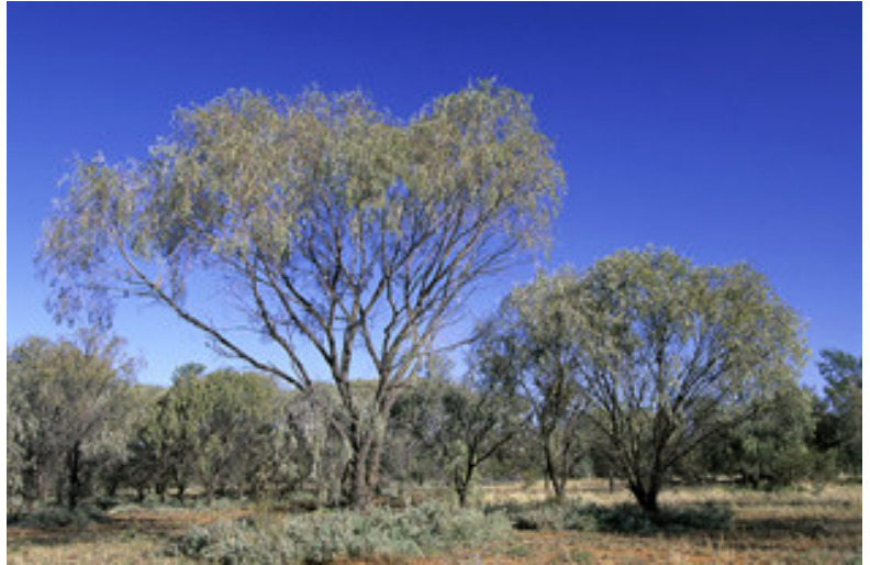
Photo 2: ID26b_img153pc.jpg Acacia pendula woodland Grenfell-West Wyalong Road, [AGD66 33°48'02.1"S 147°37'15.9"E], 19/4/02, Jaime Plaza.

Photo 1: ID26a_img014pc.jpg Acacia pendula woodland, Lake Urana Nature Reserve, [AGD66 35°16'09.8"S 146°08'32.9"E], 9/4/02, Jaime Plaza.