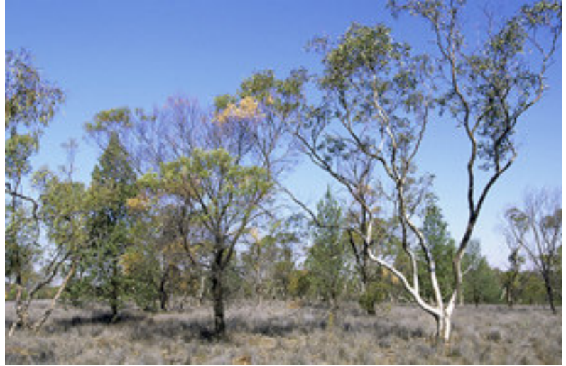
Photo 2: ID257b_SWS0507367.jpg Low open woodland dominated by Dwyer's Gum ( Eucalyptus dwyeri ), Currawang ( Acacia doratoxylon ) and White Cypress Pine ( Callitris glaucophylla ) with a grassy ground cover on a conglomerate ridge near Lake Cowal, [AGD66 33°41.879'S 147°22.995'E], 31/5/2007, Jaime Plaza.

Photo 1: ID257a_img138pc.jpg Eucalyptus dwyeri - Acacia doratoxylon mallee grassy woodland, Monia Gap near Hillston, [AGD66 33°35'17.2"S 145°53'30.0"E], 18/4/02, Jaime Plaza.