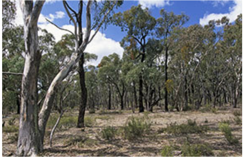
Photo 2: ID318b_PC196-8.jpg Eucalyptus sideroxylon - E.macrorhyncha shrubbt woodland on shallow clay soil on the Hume Highway south of Tarcutta, [AGD66 35°25'12"S 147°38'30"E], 17/10/02, Jaime Plaza.

Photo 1: ID318a_PC185-9.jpg Eucalyptus sideroxylon - E.dealbata woodland on clay soil on hills south of Cootamundra, [AGD66 34°43'20"S 147°54'13"E], 14/10/02, Jaime Plaza.