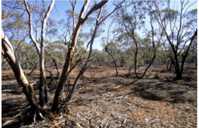
Photo 2: ID173b_img137pc.jpg Eucalyptus socialis - E.gracilis sandplain mallee woodland, Loughnan Nature Reserve, [AGD66 33°34'18.6"S 145°47'03.1"E], 18/4/02, Jaime Plaza.

Photo 1: ID173a_img123pc.jpg Eucalyptus socialis sandplain mallee shrubland, just north of Kajuligah Nature Reserve, [AGD66 32°33'24.0"S 144°42'11.5"E], 17/4/02, Jaime Plaza.