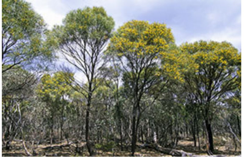
Photo 2: ID317b_PC178-2.jpg Acacia doratoxylon very tall shrubland, Weddin Mountains National Park, [AGD66 33°54'39"S 147°57'13"E], 12/10/02, Jaime Plaza.

Photo 1: ID317a_PC171-2.jpg Acacia doratoxylon very tall shrubland on sandstone ridge in Nangar National Park, [AGD66 33°25'30"S 148°31'47"E], 10/10/02, Jaime Plaza.