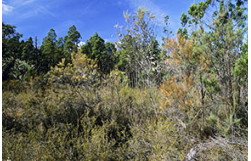
Photo 2: ID292b_PC183-14.jpg Allocasuarina diminuta - Calytrix tetragona shrubland, Ingalba Nature Reserve, [AGD66 34°26'56"S 147°25'58"E], 13/10/02, Jaime Plaza.

Photo 1: ID292a_PC248-5.jpg Allocasuarina diminuta - Calytrix tetragona shrubland on a rocky ridge in Goobang National Park, [AGD66 32°55'41.8"S 148°23'46"E], 04/05/2005, Jaime Plaza.