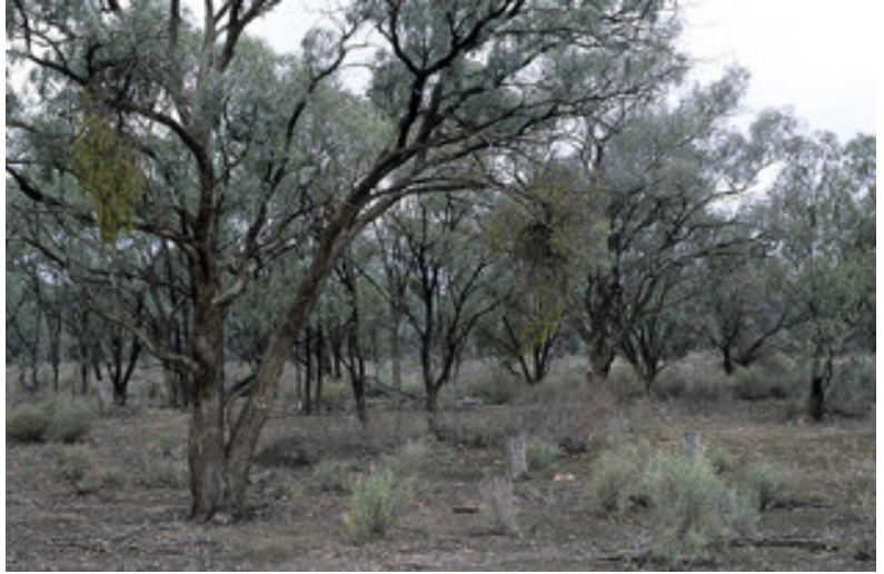
Photo 2: ID13b_img035pc.jpg Eucalyptus largiflorens - Chenopodium nitrariaceum . woodland, Echuca-Barham Rd, [AGD66 35°44'04.2"S 144°29'14.4"E], 11/4/02, Jaime Plaza.

Photo 1: ID13a_img066pc.jpg Eucalyptus largiflorens - Chenopodium nitrariaceum woodland, Kemendok Nature Reserve, [AGD66 34°32'11.3"S 142°24'15.0"E], 13/4/02, Jaime Plaza.