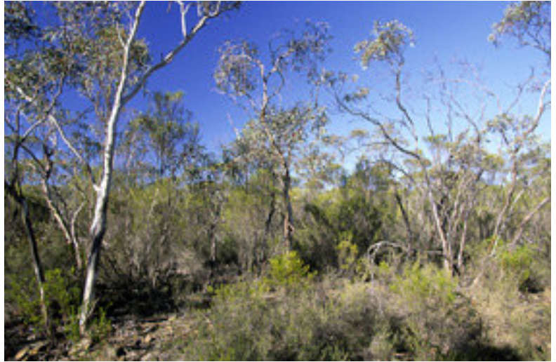
Photo 2: ID178b_img149pc.jpg Melaleuca uncinata - Eucalyptus viridis shrubland, The Charcoal Tank Nature Reserve, [AGD66 33°59'08.0"S 147°09'07.4"E], 19/4/02, Jaime Plaza.

Photo 1: ID178a_img148pc.jpg Melaleuca uncinata - Eucalyptus dwyeri shrubland, The Charcoal Tank Nature Reserve, [AGD66 33°59'08.0"S 147°09'07.4"E], 19/4/02, Jaime Plaza.