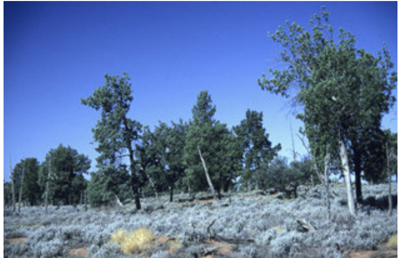
Photo 3: ID28c_img159pc.jpg Cleared Callitris glaucophylla woodland near Deniliquin, [AGD66 35°39'51.0"S 145°20'18.0"E], 10/4/02, Jaime Plaza.

Photo 2: ID28b_img310pc.jpg Callitris glaucophylla open woodland with chenopod shrub ground cover on a prior stream, SW NSW, May 1994, J.S. Benson.