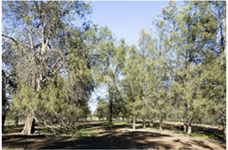
Photo 2: ID55b_BBSMAY09_0071.jpg Belah ( Casuarina cristata ) open forest remnant on basalt soils on the Liverpool Plains, [AGD66 31°0'47.8"S, 149°57'58.7"E], 6/5/09, Jaime Plaza.

Photo 1: ID55a_SWS0507326.jpg Belah ( Casuarina cristata ) woodland between Wyalong and Barmedman in the NSW central-south wheatbelt, [AGD66 33°57.985"S 147°20.255"E], 31/5/2007, Jaime Plaza.