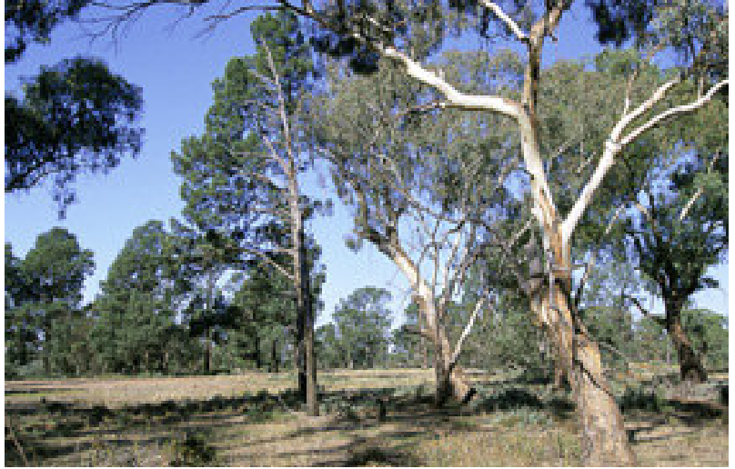
Photo 2: ID75b_img012pc.jpg Eucalyptus melliodora - Callitris glaucophylla woodland, Lake Urana Nature Reserve, [AGD66 35°16'15.6"S 146°08'54.8"E], 9/4/02, Jaime Plaza.

Photo 1: ID75a_img013pc.jpg Eucalyptus melliodora - Callitris glaucophylla woodland, Lake Urana Nature Reserve, [AGD66 35°16'15.6"S 146°08'54.8"E], 9/4/02, Jaime Plaza.