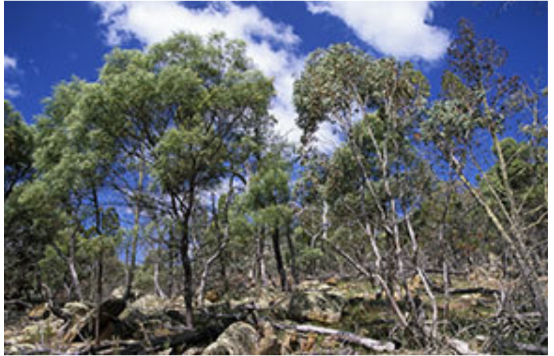
Photo 2: ID186b_PC252-23.jpg Eucalyptus dwyeri - Acacia doratoxylon low woodland on Burrabidine Peak in Goobang National Park, [AGD66 32°46'40.9"S 148°20'20.4"E], 05/05/2005, Jaime Plaza.

Photo 1: ID186a_PC185-20.jpg Eucalyptus dwyeri - Acacia doratoxylon - Callitris endlicheri low woodland, Ulandra Nature Reserve, [AGD66 34°46'30"S 147°53'54"E], 14/10/02, Jaime Plaza.