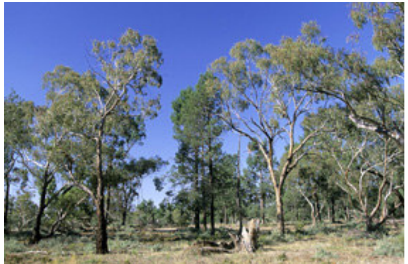
Photo 3: ID75c_img010pc.jpg Cleared Eucalyptus melliodora - Callitris glaucophylla woodland, north of Urana, [AGD66 35°00'42.7"S 146°30'30.5"E], 9/4/02, Jaime Plaza.

Photo 2: ID75b_img012pc.jpg Eucalyptus melliodora - Callitris glaucophylla woodland, Lake Urana Nature Reserve, [AGD66 35°16'15.6"S 146°08'54.8"E], 9/4/02, Jaime Plaza.