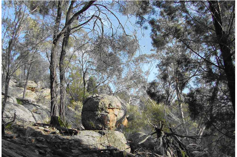
Photo 1: ID185a_Porteners.jpg Eucalyptus dwyeri - Callitris glaucophylla - Acacia doratoxylon low woodland on granite ridge at Snake Rock east of Tullamore, 03/2005, M. Porteners.

Veg. Comm. ID.: 185 Original Entry: John Benson 31/12/2005