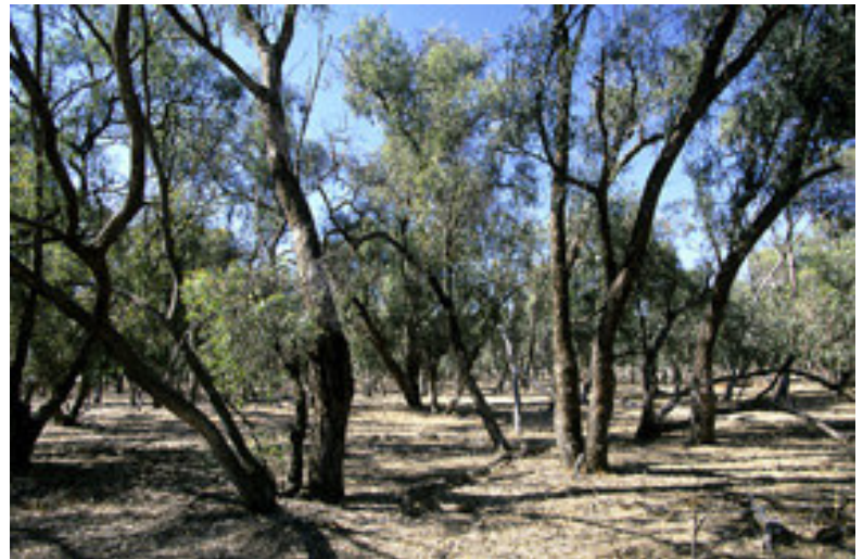
Photo 3: ID13c_img033pc.jpg Wetland salinity, dead Eucalyptus largiflorens , Echuca-Barham Rd, [AGD66 35°48'67.9"S 144°31'35.4"E], 11/4/02, Jaime Plaza.

Photo 2: ID13b_img035pc.jpg Eucalyptus largiflorens - Chenopodium nitrariaceum . woodland, Echuca-Barham Rd, [AGD66 35°44'04.2"S 144°29'14.4"E], 11/4/02, Jaime Plaza.