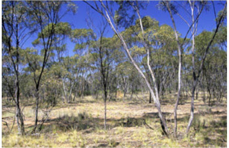
Photo 2: ID176b_img232pc.jpg Eucalyptus viridis Woodland (degraded), Sth of Canbelego, [AGD66 31°38'05.0"S 146°20'07.0"E], 26/10/01, Jaime Plaza.

Photo 1: ID176a_img193pc.jpg Eucalyptus viridis Woodland, Tottenham-Albert Rd [AGD66 32°22'22.2"S 147°25'21.6"E], 27/10/01, Jaime Plaza.