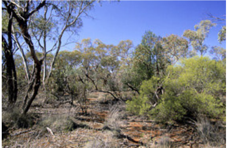
Photo 3: ID173c_img140pc.jpg Eucalyptus socialis - E.dumosa sandplain mallee woodland, Hillston-Rankins Springs Rd, [AGD66 33°37'52.8"S 146°00'18.6"E], 18/4/02, Jaime Plaza.

Photo 2: ID173b_img137pc.jpg Eucalyptus socialis - E.gracilis sandplain mallee woodland, Loughnan Nature Reserve, [AGD66 33°34'18.6"S 145°47'03.1"E], 18/4/02, Jaime Plaza.