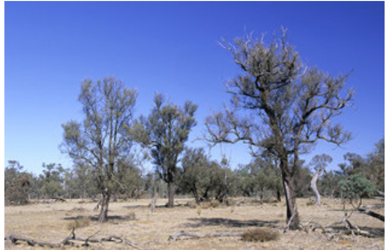
Photo 3: ID20c_img037pc.jpg Allocasuarina luehmannii - Melaleuca lanceolata . woodland, Echuca-Barham Rd, [AGD66 35°40'45.2"S 144°27'21.8"E], 11/4/02, Jaime Plaza.

Photo 2: ID20b_img036pc.jpg Allocasuarina luehmannii - Melaleuca lanceolata . woodland, Echuca-Barham Rd, [AGD66 35°40'45.2"S 144°27'21.8"E], 11/4/02, Jaime Plaza.