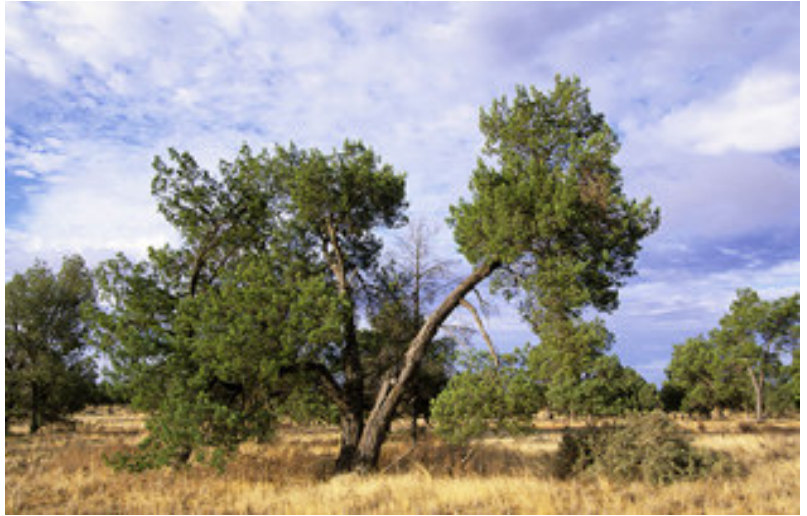
Photo 2: ID28b_img310pc.jpg Callitris glaucophylla open woodland with chenopod shrub ground cover on a prior stream, SW NSW, May 1994, J.S. Benson.

Photo 1: ID28a_img069pc.jpg Callitris glaucophylla - Maireana pyramidata woodland, 40 kms nth Wentworth, [AGD66 33°41'22.1"S 141°47'32.0"E], 13/4/02, Jaime Plaza.