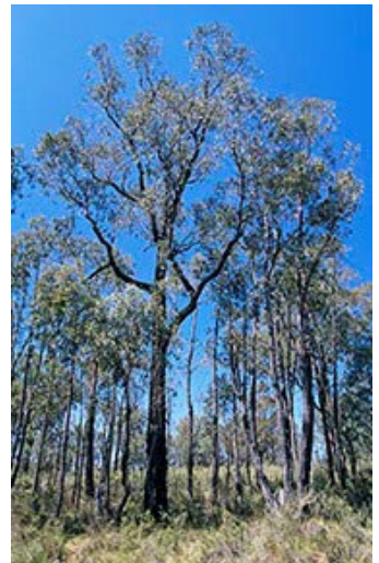
Photo 3: ID318c_PC245-10.jpg Eucalyptus sideroxylon - Eucalyptus dealbata ridge woodland on ridge along the Manildra - Parkes Road, [AGD66 33°11'33"S 148°29'48.2"E], 03/05/2005, Jaime Plaza.

Photo 2: ID318b_PC196-8.jpg Eucalyptus sideroxylon - E.macrorhyncha shrubbt woodland on shallow clay soil on the Hume Highway south of Tarcutta, [AGD66 35°25'12"S 147°38'30"E], 17/10/02, Jaime Plaza.