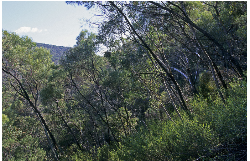
Photo 3: ID317c_PC203-13.jpg Acacia doratoxylon very tall shrubland in Benambra National Park, [AGD66 35°48'13"S 147°04'28"E], 19/10/02, Jaime Plaza.

Photo 2: ID317b_PC178-2.jpg Acacia doratoxylon very tall shrubland, Weddin Mountains National Park, [AGD66 33°54'39"S 147°57'13"E], 12/10/02, Jaime Plaza.