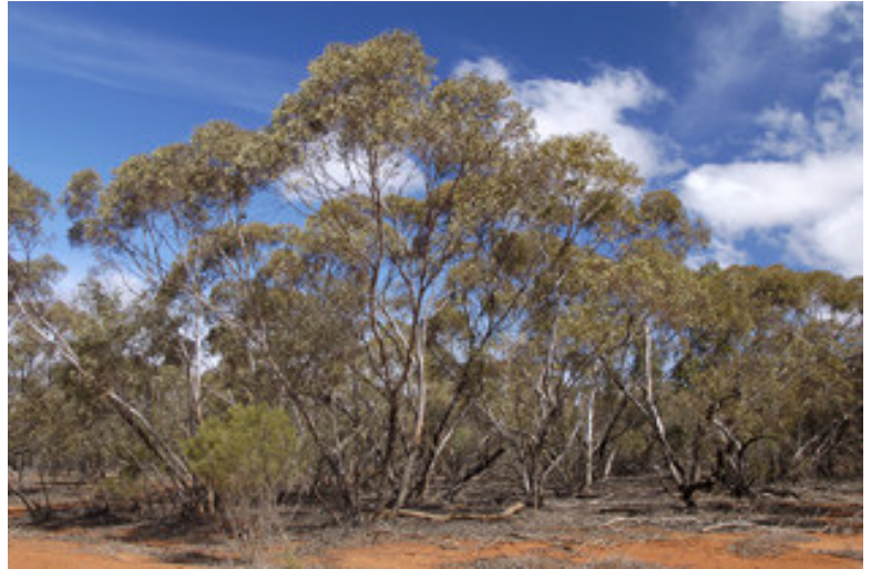
Photo 1: ID174a_dsc_1877.jpg Eucalyptus socialis - Callitris glaucophylla sandplain mallee, southern edge of Mt Grenfell Historic Site, [AGD66 31°19'33"S 145°18'13"E; 18/8/03.

Characteristic Vegetation: (Combination of Quantitative Data and Qualitative Estimate)