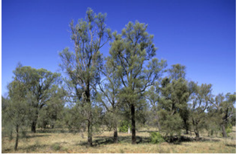
Photo 2: ID20b_img036pc.jpg Allocasuarina luehmannii - Melaleuca lanceolata . woodland, Echuca-Barham Rd, [AGD66 35°40'45.2"S 144°27'21.8"E], 11/4/02, Jaime Plaza.

Photo 1: ID20a_img011pc.jpg Allocasuarina luehmannii - Callitris glaucophylla woodland near Lake Urana Nature Reserve, [AGD66 35°17'08.0"S 146°07'38.2"E], 9/4/02, Jaime Plaza.