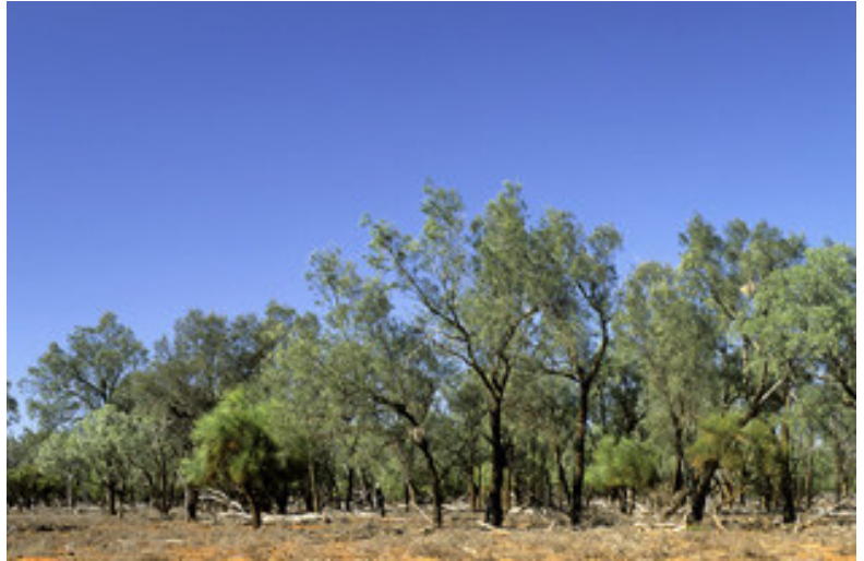
Photo 2: ID57b_img127pc.jpg Casuarina cristata - Geijera parviflora woodland, Yathong Nature Reserve, [AGD66 32°31'54.4"S 145°34'37.2"E], 17/4/02, Jaime Plaza.

Photo 1: ID57a_img124pc.jpg Casuarina cristata - Exocarpos aphyllus woodland north of Kajuligah Nature Reserve, [AGD66 32°33'44.7"S 144°43'01.8"E], 17/4/02, Jaime Plaza.