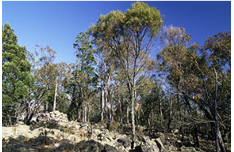
Photo 3: ID186c_DX28235.jpg Dwyer's Red Gum ( Eucalyptus dwyeri ) with Callitris endlicheri and the shrubs Calytrix tetragona and Acacia verniciflua on rocky outcrops in Woomargama National Park, [AGD66 35°51.792'S 147°23.501'E], 2/5/2006, Jaime Plaza.

Photo 2: ID186b_PC252-23.jpg Eucalyptus dwyeri - Acacia doratoxylon low woodland on Burrabidine Peak in Goobang National Park, [AGD66 32°46'40.9"S 148°20'20.4"E], 05/05/2005, Jaime Plaza.