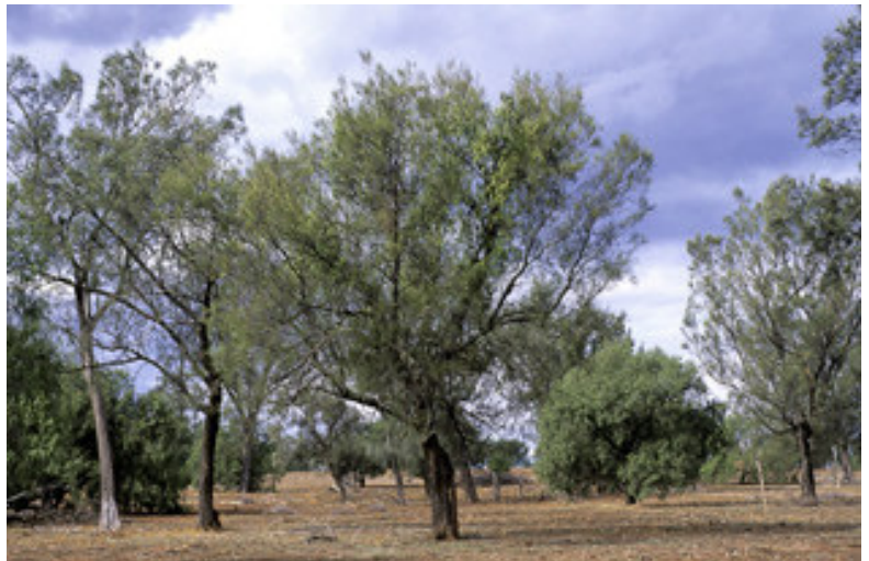
Photo 3: ID57c_dsc_1945.jpg Casuarina cristata - Alectryon oleifolius woodland, approx. 50km north west of Cobar, [AGD66 31°10'2"S 145°30'31"E], 19/8/03, Jaime Plaza.

Photo 2: ID57b_img127pc.jpg Casuarina cristata - Geijera parviflora woodland, Yathong Nature Reserve, [AGD66 32°31'54.4"S 145°34'37.2"E], 17/4/02, Jaime Plaza.