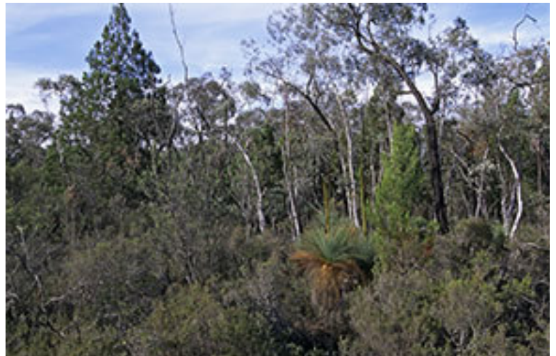
Photo 3: ID292c_PC171-6.jpg Calytrix tetragona - Allocasuarina diminuta heath, Nangar Mountain in Nangar National Park, [AGD66 33°25'50"S 148°31'37"E], 10/10/02, Jaime Plaza.

Photo 2: ID292b_PC183-14.jpg Allocasuarina diminuta - Calytrix tetragona shrubland, Ingalba Nature Reserve, [AGD66 34°26'56"S 147°25'58"E], 13/10/02, Jaime Plaza.