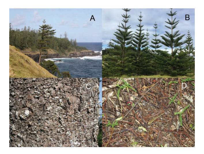
Fig. 2. (A) Coastline of Norfolk Island. (B) Young Norfolk Island pines. (C) Bark surface of Norfolk Island pine. (D) Forest floor leaf litter.