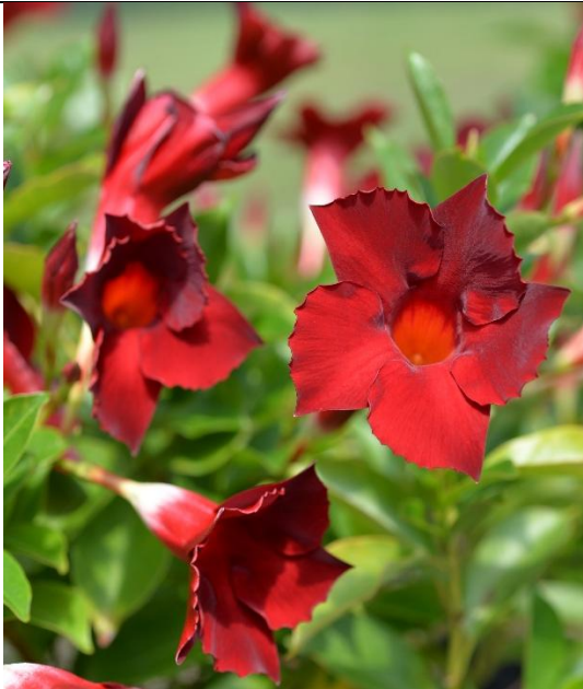
Mandevilla hybrid 'Burgundy'

There didn't seem to be a time where this Limonium wasn't in full flower. Huge impact and volume of flower per plant. The flowers last for weeks. Typically reaching about 50cm high and 40cm across. Even the flower stems are a unique shape and a vibrant green.