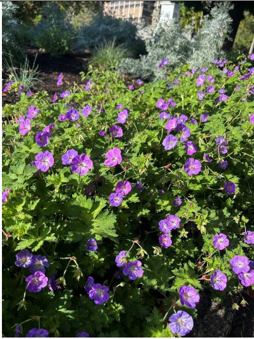
Geranium hybrid x wallichianum 'Rozanne'

Geranium Rozanne is a much-loved perennial famous for its incredibly long flowering season and vibrant violet-blue blooms with soft, rosy centres. Easy-going and hardy, it spreads gently to form a lush mound of foliage that turns reddish in autumn. Perfect for borders, cottage gardens, and containers, 'Rozanne' is low-maintenance, attracts pollinators, and thrives in sun or part shade