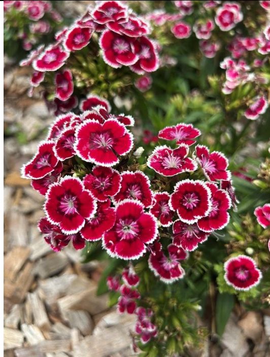
Dianthus barbatus 'Red and White Picotee'

Groundswell is more compact and tidy than the common form of Hibbertia scandens . It forms a dense groundcover suitable to most soil types and climates and its compact form makes it an effective weed suppressant. This plant is very low-maintenance and consistently looks healthy and tidy. We give it a small prune to keep it compact and stop it trailing too far. Full sun or part shade.