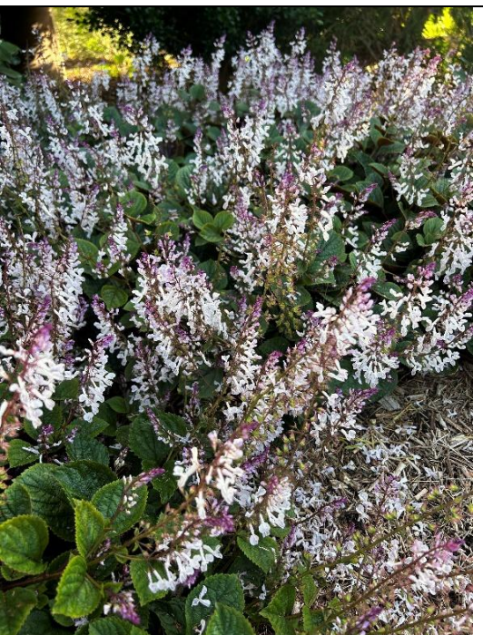
Plectranthus ciliatus 'Flora Mound'

Bright, green and glossy this shrub grows about 1.8m high and wide. It's excellent for hedging or bringing life to those tricky spots and it requires minimal maintenance. Pittosporum Green Dome is remarkably tough, tolerating sun, heat, frost, drought, wind and a range of soil types.