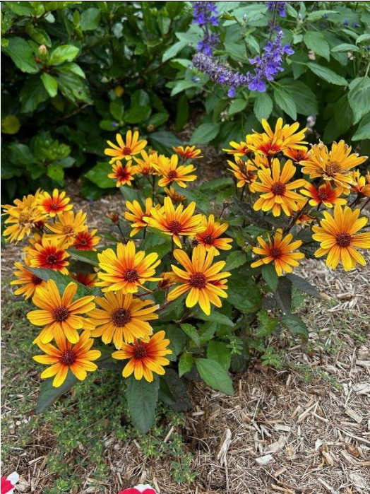
Heliopsis helianthoides 'Funky Spinner'

A top performer of 2025, this compact perennial groundcover stands out for its rich purple blooms that continue for months. It's easy to grow, loved by pollinators and stays neat and tidy in the garden. It seems to tolerate any area of the garden from sun to shade, dry to wet.