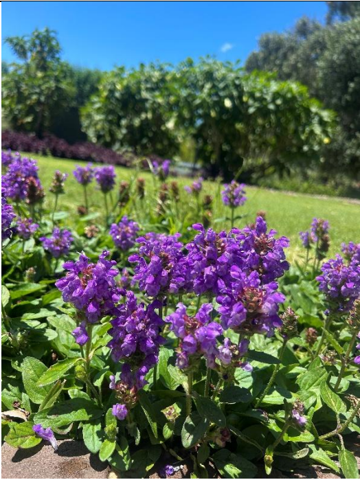
Prunella grandiflora 'Purple Loveliness'

Geranium Rozanne is a much-loved perennial famous for its incredibly long flowering season and vibrant violet-blue blooms with soft, rosy centres. Easy-going and hardy, it spreads gently to form a lush mound of foliage that turns reddish in autumn. Perfect for borders, cottage gardens, and containers, 'Rozanne' is low-maintenance, attracts pollinators, and thrives in sun or part shade