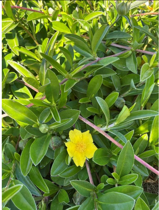
Hibbertia scandens 'Groundswell'