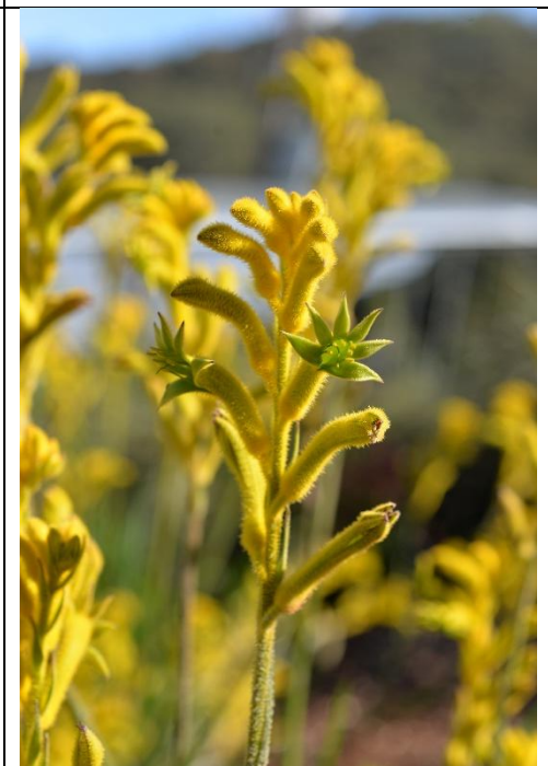
Kangaroo Paw Anigozanthos hybr 'Bush Sunburst'

A very tough native grass, it can grow just about anywhere and has beautiful, fine green leaves. It thrives in full sun to moderate shade and grows to around 40-50cm high and 60-75cm wide. Perfect for a mass plant in troublesome spots or as a feature grass amongst a flower display. We love native grasses!