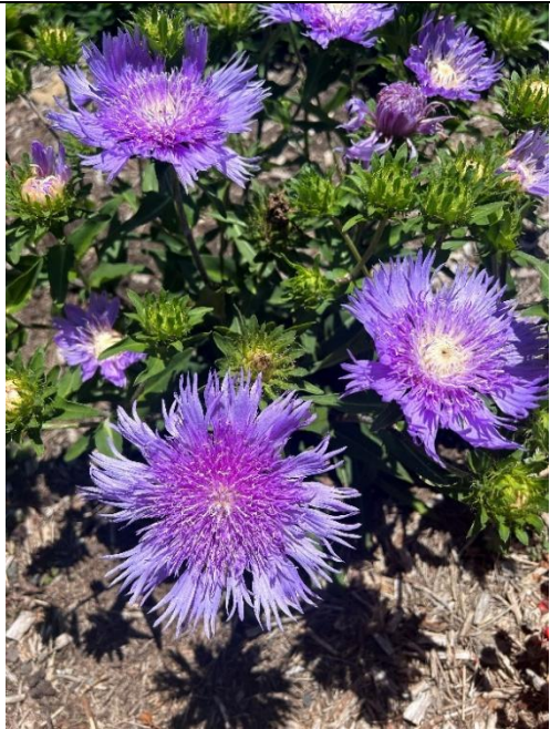
Stokesia laveis 'Mega Mels'

A fast growing shrub reaching 2m tall and wide. It's great for gaps, hedges, screens or even as a feature. It has a strong aroma of mint with hints of pepper and earthy tones. Full sun or part shade. A fantastic edible native.