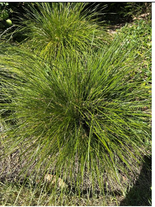
Lomandra longifolia 'Lady Tanika'

'Flora Mound' Plectranthus is a tough, eye-catching ground cover. It has masses of vibrant purple and white flowers in autumn. Low maintenance, adaptable and perfect in shade. It grows about 20-40 cm high and about a 1m wide. We planted 6 about 50cm apart in a semi-shade position, it becomes a dense ground cover with a beautiful flower display and suppressing weeds at the same time!