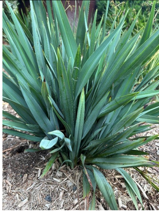
Dianella spp 'DIAN04' PBR Summer Rev™

This Dianthus features vivid red blooms edged in crisp white for a classic picotee look. Compact and colourful, it adds cheerful charm to borders, pots, or dotted amongst the garden. Its long-lasting blooms make it a standout in any summer display.