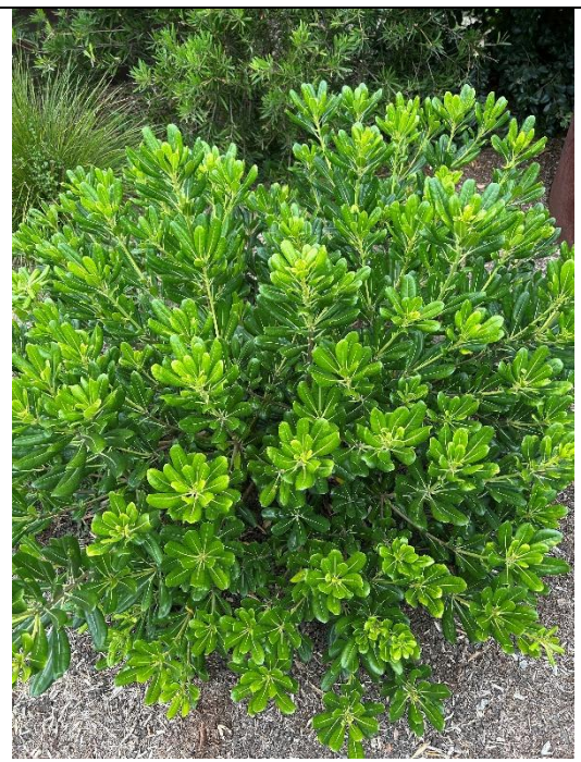
Pittosporum tobira 'Green Dome'

Candy Queen is a heat and drought-tolerant interspecific hybrid that produces bright candy-pink flowers against vibrant green foliage. Ideal for hanging baskets, pots, and garden beds, it offers repeat blooms, is low maintenance, and provides year-round flowering. Growing to about 30 × 40 cm, it thrives in full sun to part shade and requires little water once established.